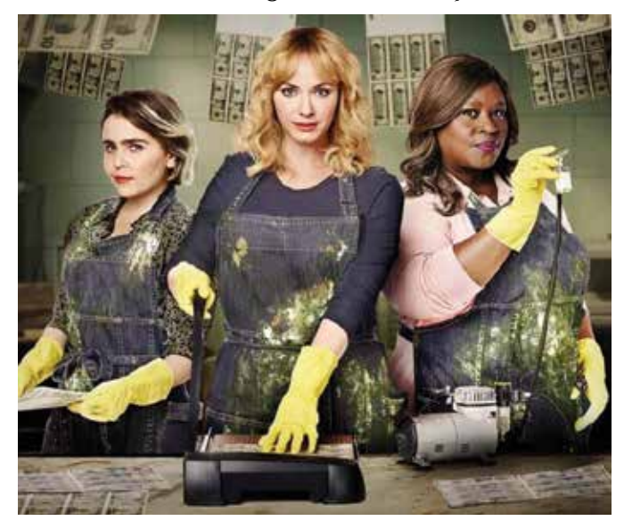
The "Good Girls" counterfeiting money in Season 3.

When the filming of a scene needs to take place on a set and not at the Printing Museum, it requires