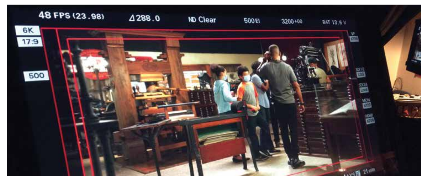
View from the cameraman's monitor for a commercial shot in Museum gallery.

Our presses just can't stay out of the limelight! 2020 has been one of our busiest years for rentals to Hollywood.