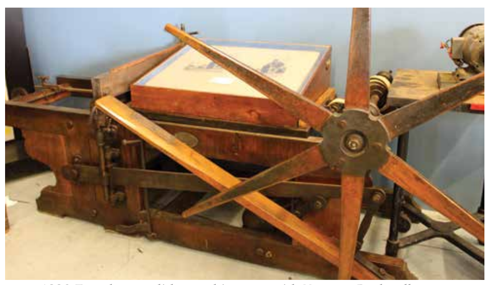
1890 French stone lithographic press with Norman Rockwell stone.

Measuring nearly 8' long, the lithographic press remains in remarkable working condition. The press was made in France by J. Busser. Presses of this style were used to print many of the color