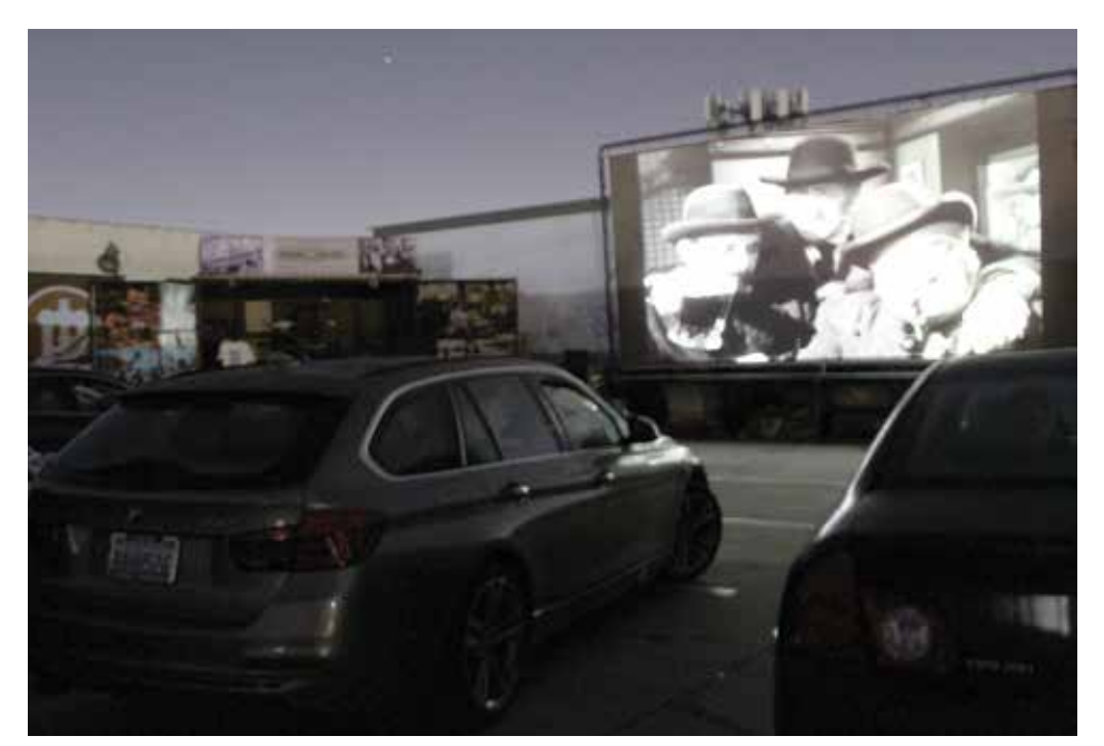
Printers' Drive-in Movie Night at the Museum during the Printers Fair, featuring "Park Row", from 1951 that is centered around 19th century printing shops.