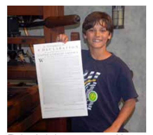
The joy of printing your own copy of the Declaration of Independance on the Colonial Press, circa 1780.

Besides work at our museum, the Printing Museum continues to be a resource for other museum's and institutions in Southern California. We are finding many new venues in which to