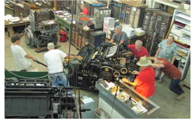
It took a of muscle to get this 6,000 pound behemoth into position.

The Heidelberg Windmill Press donated by