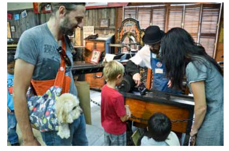
Dogs, Kids and Adults enjoy the wonders of the Western Set as Museum docent demonstrates proofing a galley of type.