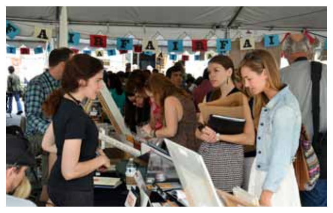
Visitors to the Printer Fair find a host of handcrafted and printed objects to purchase. Vendors enjoy answering questions about letterpress printing.