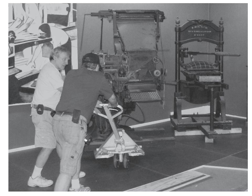
Installing exhibit at 2010 LA County Fair, "From the Industrial Age to the Computer Age."