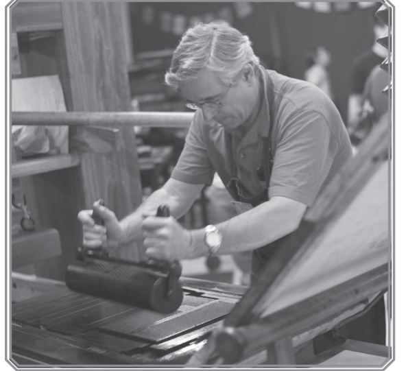
Los Angeles Printers Fair