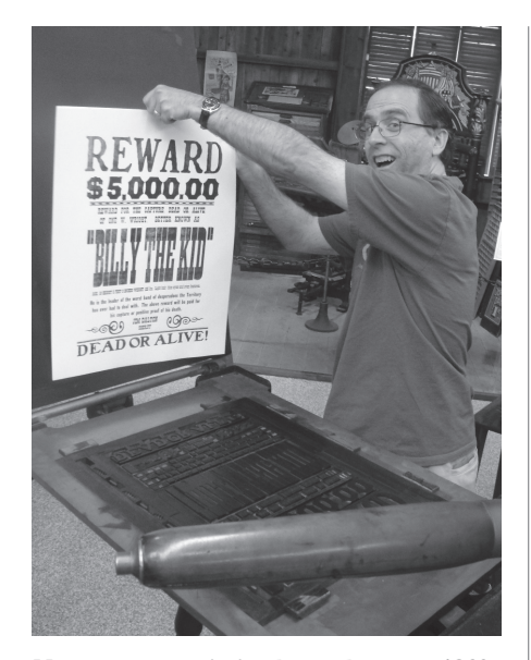
Museum guest printing keepsake on an 1860 Hand Press during Wood Type Day.

of 1787 in the Museum's Heritage Theatre. Ben Franklin and James Madison help the delegates reach decisions on issues, resulting in the signing of the Constitution.